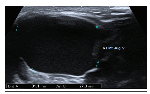
Figure 3: Grayscale ultrasound shows localized dilated right internal jugular vein, which increased during the Valsalva maneuver reaching its maximum luminal diameter of about 31 mm.

swelling, and it did not transilluminate with light. Ear, nose, and throat examinations were unremarkable. A small right testicular hydrocele was diagnosed by the surgical team and conservative treatment was planned. Neck ultrasound was performed and revealed significant dilatation of the right internal jugular vein (reaching up to31 mm in diameter) during the Valsalva maneuver[Figure 2 and 3].